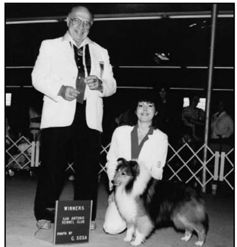
Ch. RobCary's Spirited Repartee Scotty was my last sheltie Ch.

one of my favorites. I finished several Sheltie Champions of my own and for friends and put around 25 obedience titles on my dogs and client dogs including a C.D. and C.D.X. on an Old