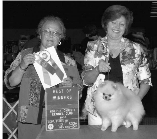
Above: “T.C.” – Ch. Starfire’s Rob Cary Too Cool, another gorgeous cream boy. He won RWD and Best Puppy at the summer 2007 APC National and he finished with multiple BOB wins. Unfortunately he broke a hind leg as a puppy and still hitches that leg once in a while so I don’t special him.