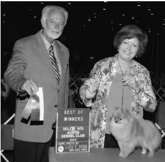
Above: “Gabby” – Ch. Rob Cary Gabriella, a gorgeous little orange girl who will be bred to Foster this year.