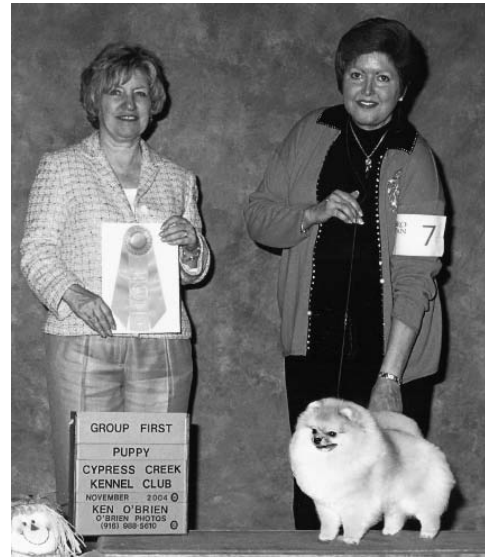
Above: “B.B.” – Ch. Starfire’s Rob Cary Bad Boy, a gorgeous cream boy who finished at 9 months with 3 majors and a Puppy Group I. His coat started looking questionable and after much soul searching I had him neutered. His coat came in beautifully after that and he is now a well loved pet.