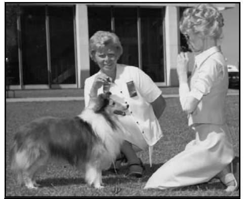
My first Sheltie Champion CH RobCary's Stormy of Scarlet Oak

at the International shows in Mexico City with multiple High in Trial and High Combined wins. Colleen helped raise my kids and was the official greeter when I started my business. She lived 17 1/2 years. My first Sheltie Champion was from my second litter, CH RobCary's Stormy