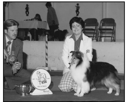
CH RobCary's Jubilant Image, J.R. was one of my favorites

My first breeder, owner handled CH RobCary's Jubilant Image, J.R. was