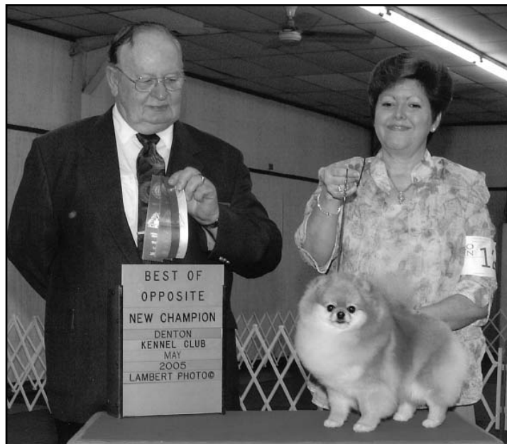
CH. Starfire's Between The Sheet Satin