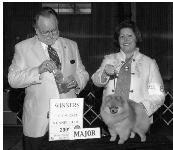
Above: “Sophia” – Ch. Rob Cary Softly Upon My Heart, finished at 10 months. She placed in a huge 6-9 Sweepstakes and Regular classes at the March 2008 APC National.